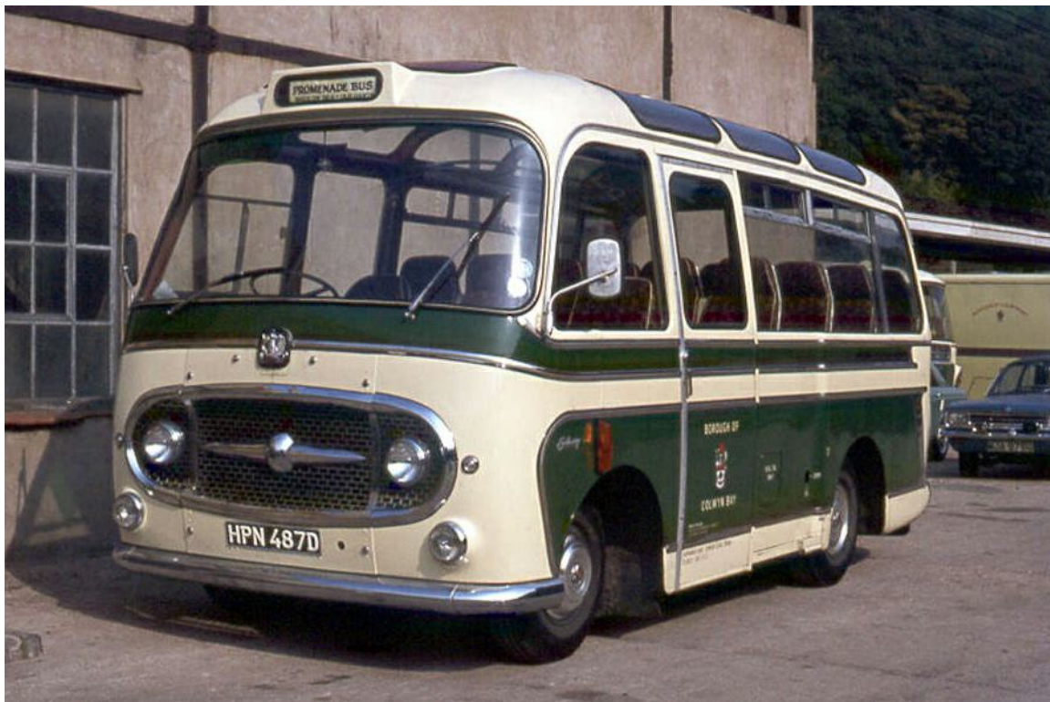
By 1968 Colwyn Bay had dispensed with fleet numbers. HPN487D was a 1966 Bedford J2S210 with Plaxton Embassy 20-seat coachwork.