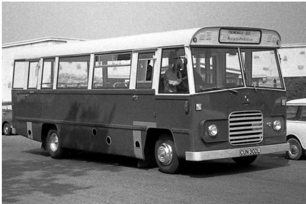
CUN302L a 1973 Bedford VAS5 with Strachans 28-seat bodywork seen here operating the Promenade service.