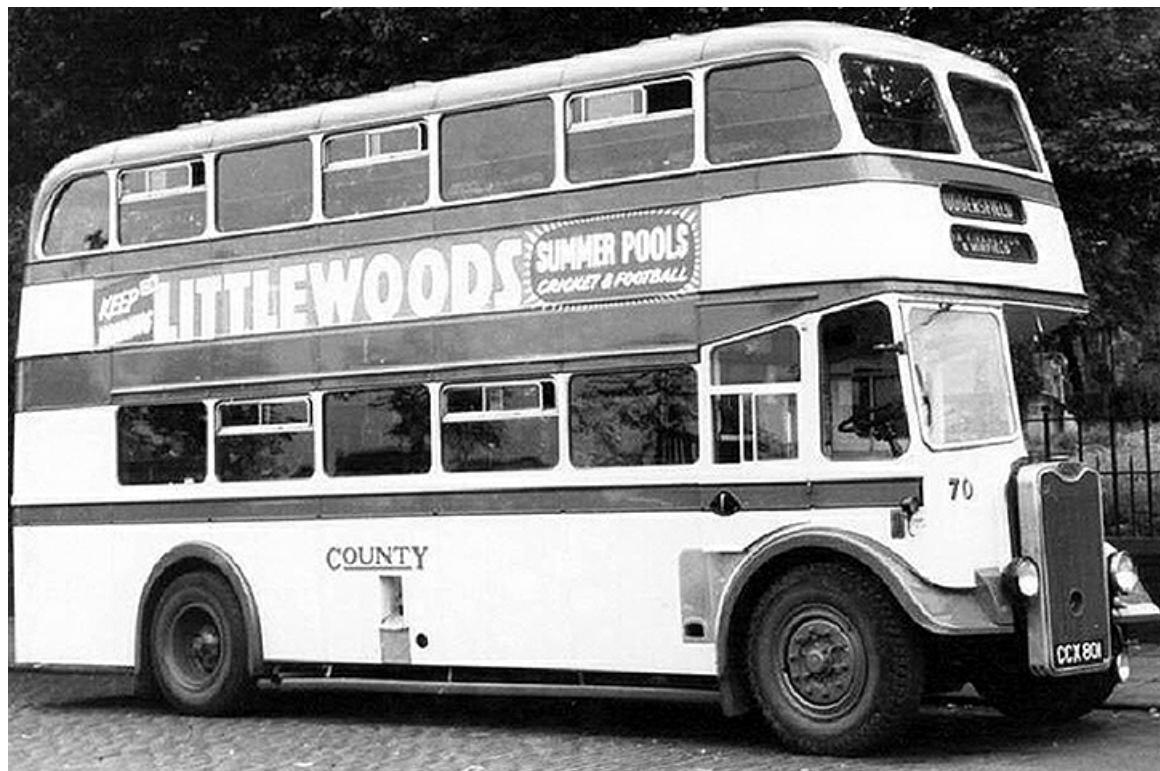
1945 Guy Arab II No. 70 (CCX801) with Roe lowbridge 53-seat bodywork, which replaced the original body (also by Roe) in 1953.