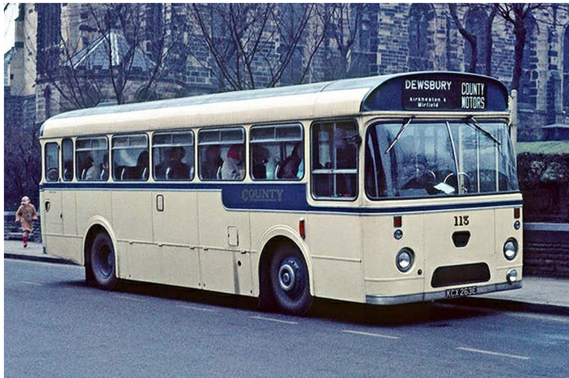
One of the last vehicles to enter service was No. 113 (KCX263E) a 1966 Leyland Tiger Cub PSUC1/12 with Marshall 45-seat dual purpose bodywork.