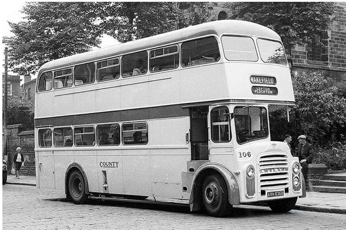
No. 106 (AVH636B) was a Leyland PD3 of 1964, which carried a Roe 73-seat forward entrance body. It passed to Yorkshire Traction in 1968 as their No. 746.