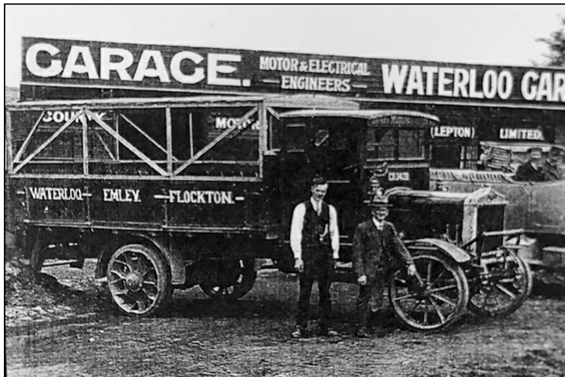
No. 2 (CX3439) was an AEC YB lorry fitted with perimeter seating for use as a bus. It was later re-bodied with a B28F body by an unknown builder. (LTHL collection).