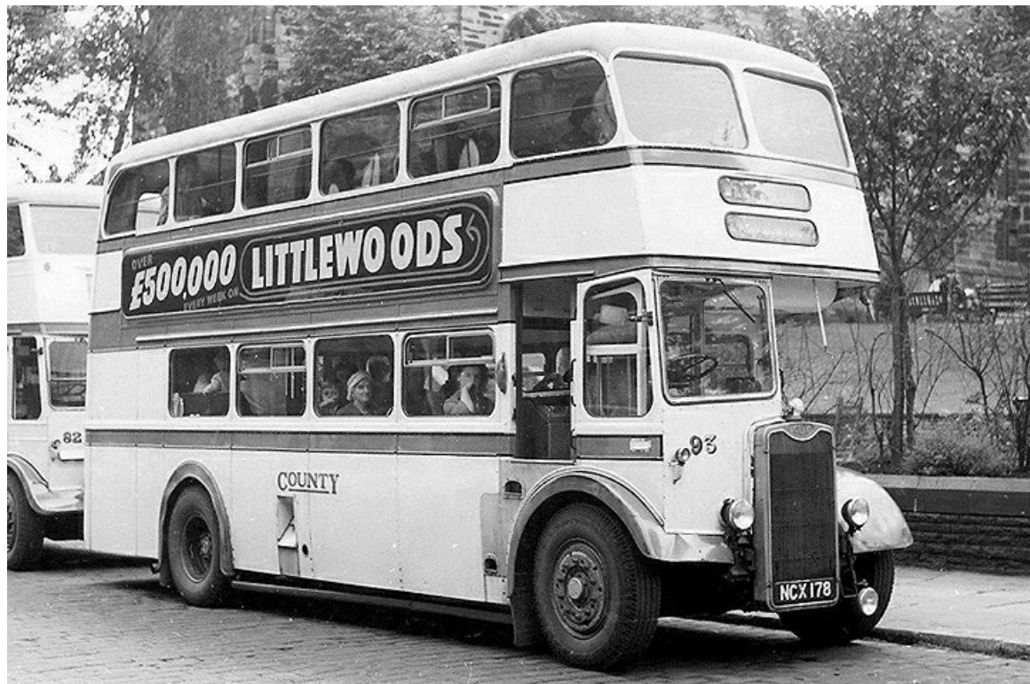
No. 93 (NCX178) was one of four Guy Arab IV's with Roe lowbridge 55-seat bodies new in 1958.