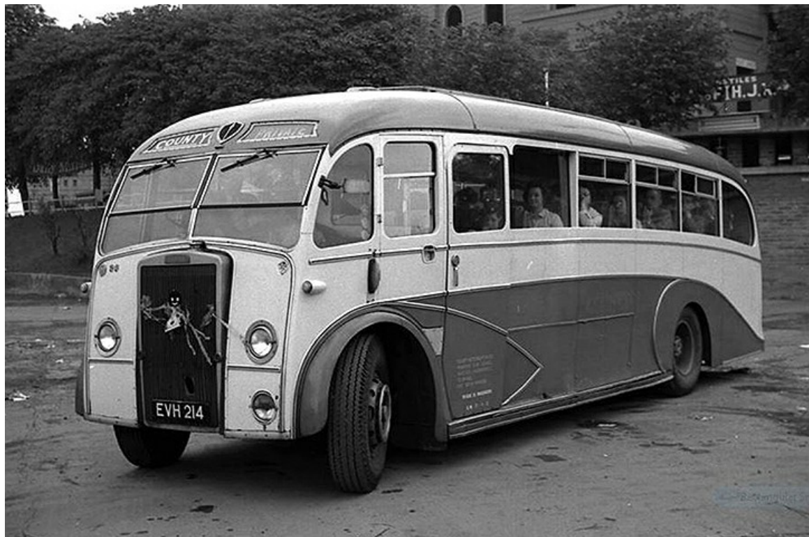
No.86 (EVH214) was a 1949 Leyland PS2 originally with a Roe half-cab body but was re-bodied in 1954 by Windover with a full front 35-seat body.