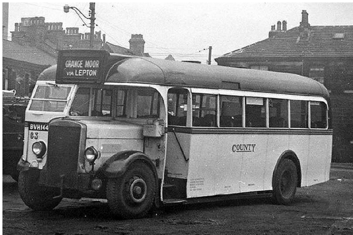
1939 Leyland TS8 No. 63 (BVH144) carried a Roe 30-seat dual-purpose body. It was withdrawn in 1950.