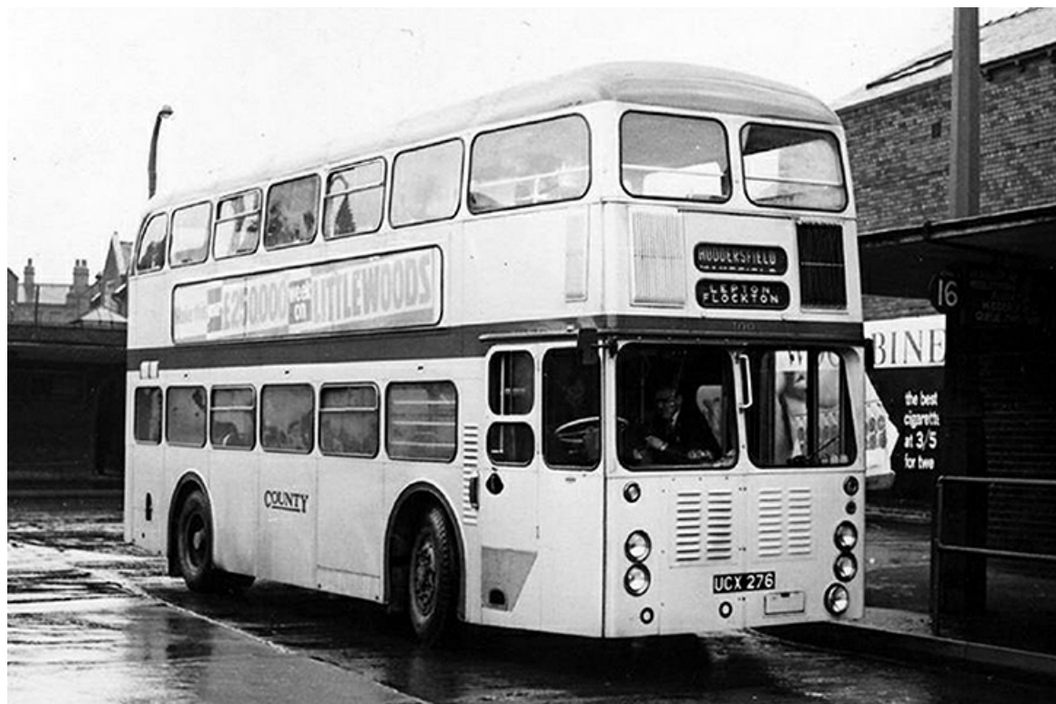
In 1961 two Guy Wulfrunian chassis with Roe 75-seat bodywork joined the fleet, no doubt influenced by West Riding who were part owners, they proved unpopular and spent just two years with County Motors before being withdrawn. This is No. 100 (UCX276).