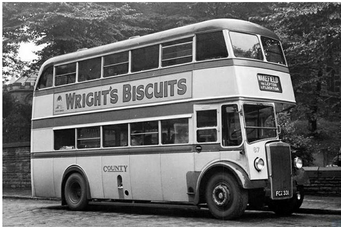
No. 87 (FCX331) a 1950 Leyland PD2/3 with Leyland 56-seat bodywork, seen here in Lord Street, Huddersfield in May 1951.