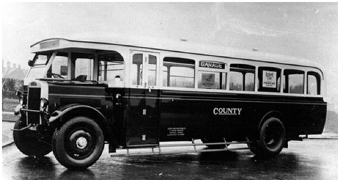
Seen here in an official Leyland Motors photograph taken before delivery is No. 41 (VH4000), a Leyland LT1 with Leyland B32F bodywork.