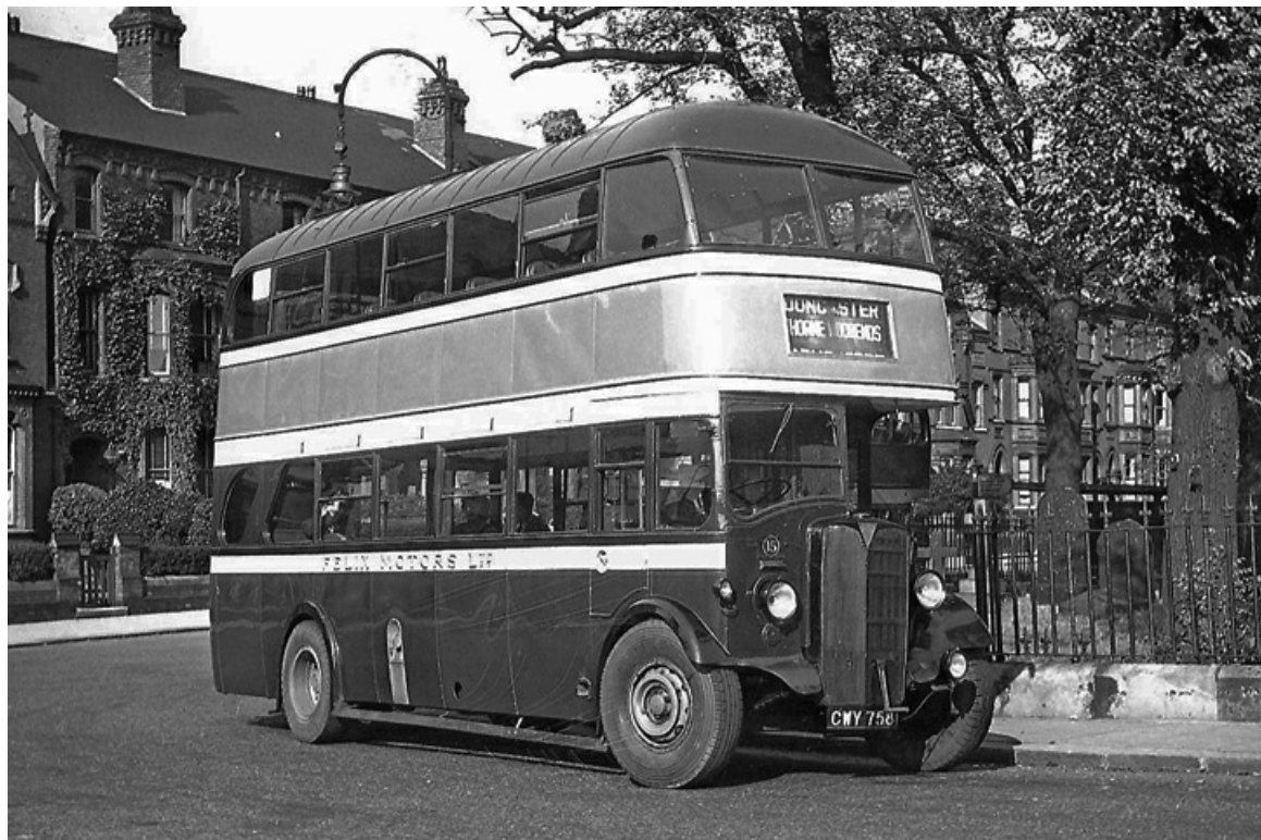
Felix Motors' first double-decker was No. 15 (CWY758), a 1938 AEC Regent with Roe H31/25R bodywork. (Bus Archive).