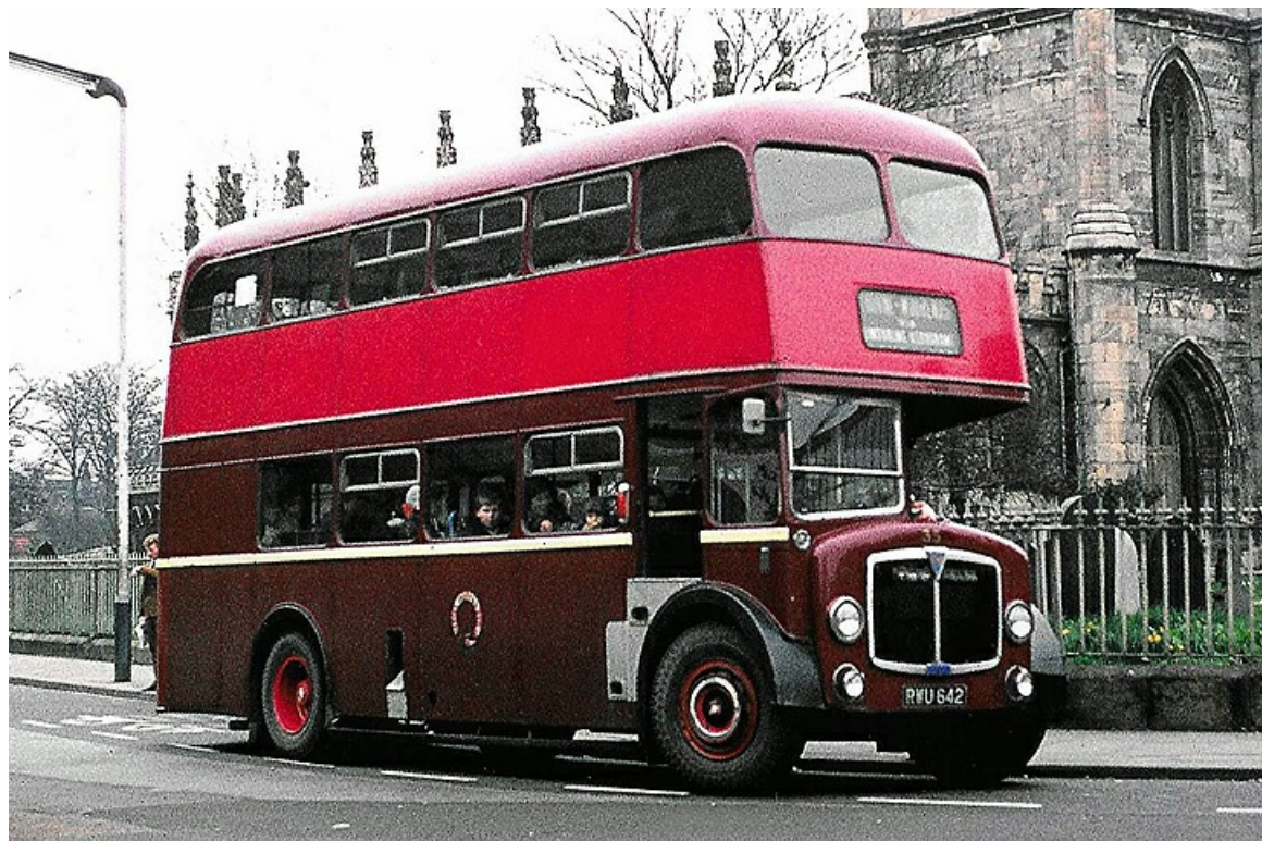
AEC Regent V No. 35 (RWU642) carried Roe H31/25R bodywork and dated from 1956.