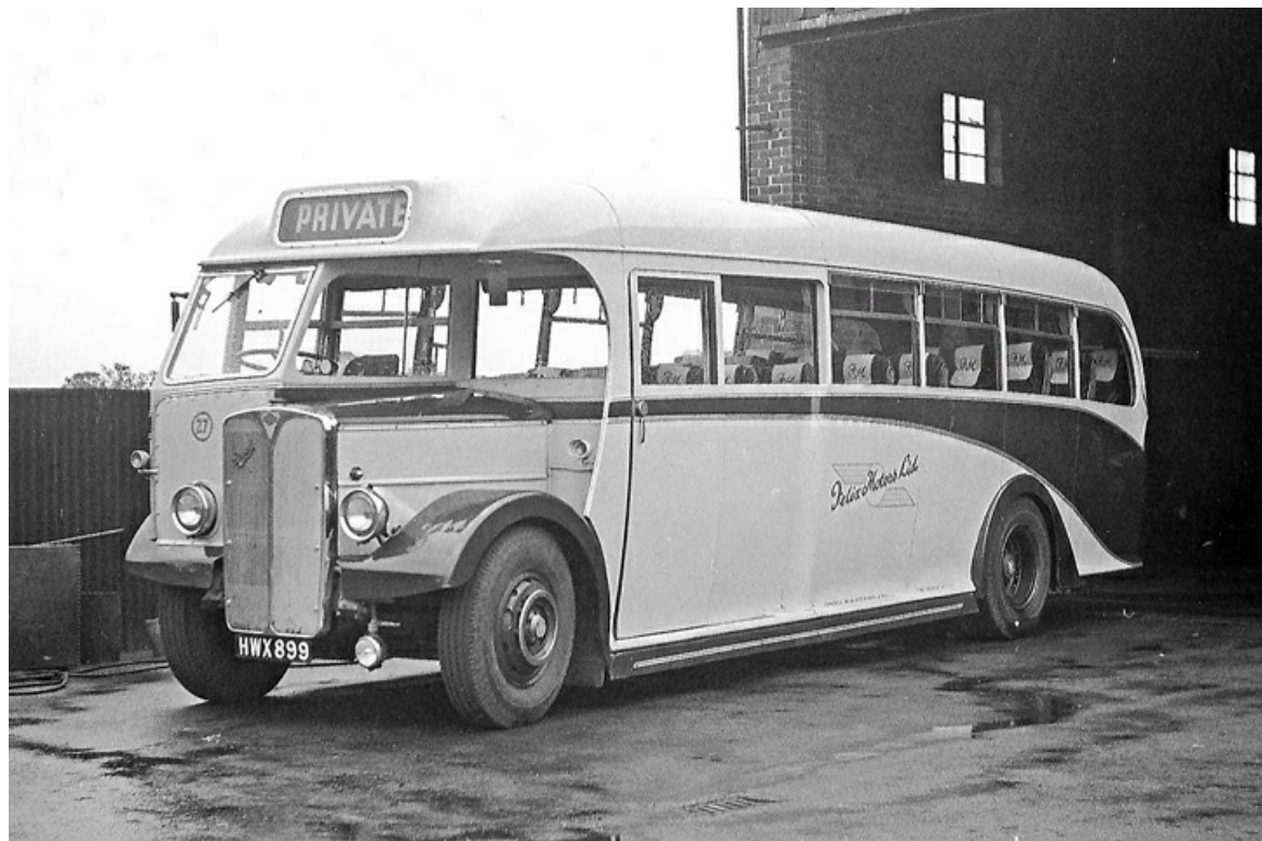
No. 27 (HWX899), a 1949 AEC Regal with attractive Barnaby 35-seat coachwork.