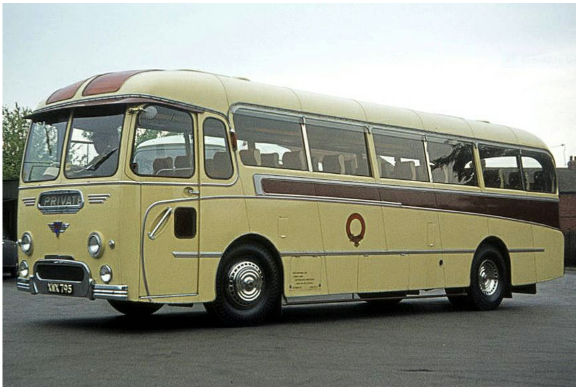
No. 40 (XWX795), a 1959 AEC Reliance with Roe 41-seat coachwork, seen here at Felix's Park Lane depot in 1973.