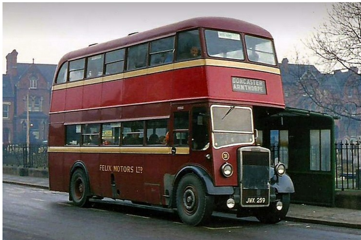
No. 31 (JWX259) was a Leyland PD2/1 with Leyland 56-seat bodywork, dating from 1950. It was withdrawn in 1966. (LTHL collection).