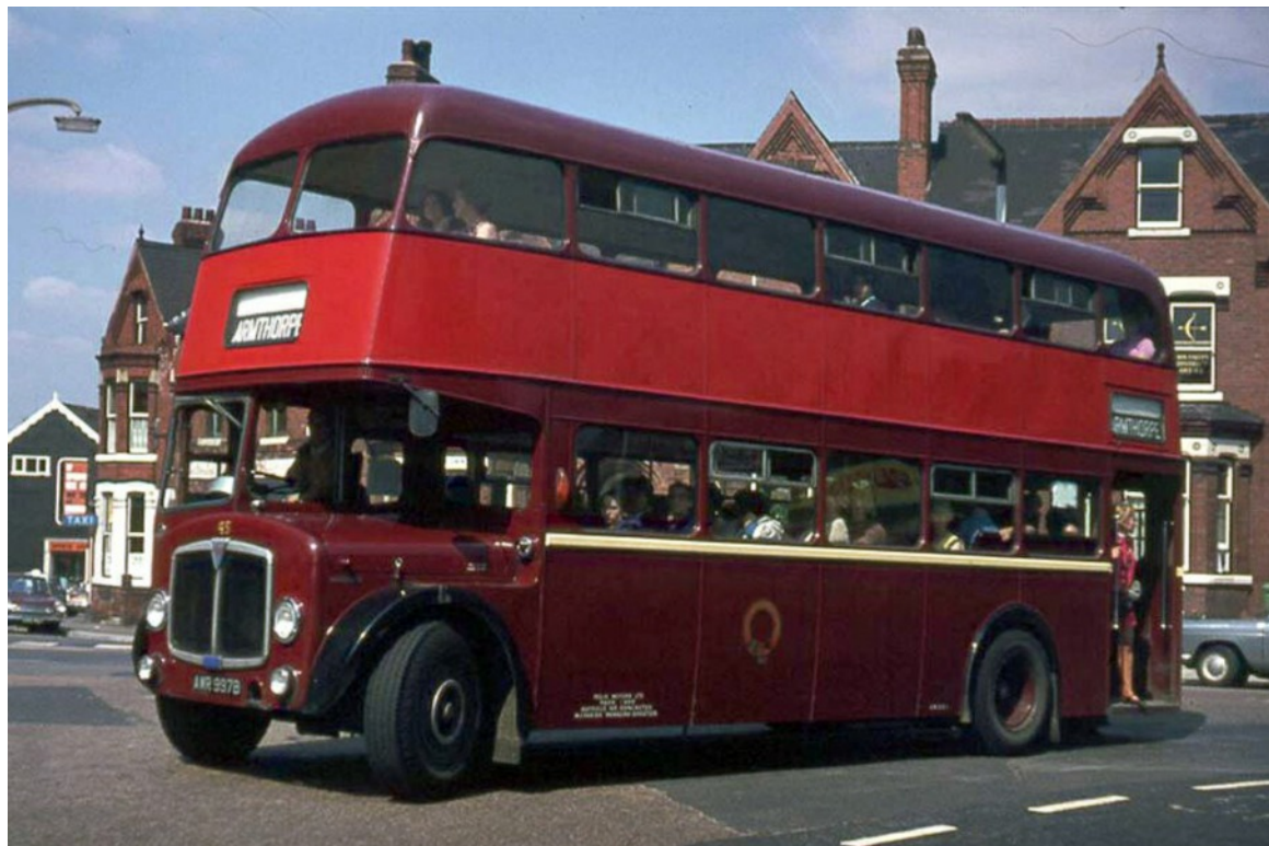
Turning into East Laith Gate in August 1970 is No. 45 (AWR997B), a 1964 AEC Regent V with Roe 73-seat bodywork.