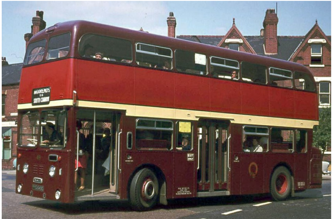
No. 49 (YYG649G) was Felix Motors' first rear-engined vehicle. It was a 1969 Daimler CRG6LX with Roe 74-seat dual door bodywork.