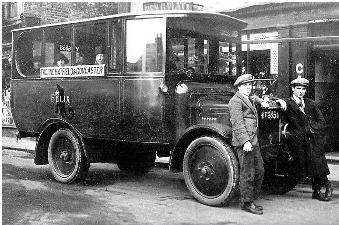
WT6858 was a 1924 Guy J with 14-seat bodywork by an unknown builder, that came from the Parrish Brothers partnership after it was dissolved, in 1925.