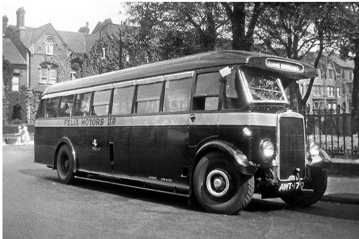
No. 14 (AWT140) was a Leyland LT7 'Lion' with Barnaby B32F bodywork, new in 1935.