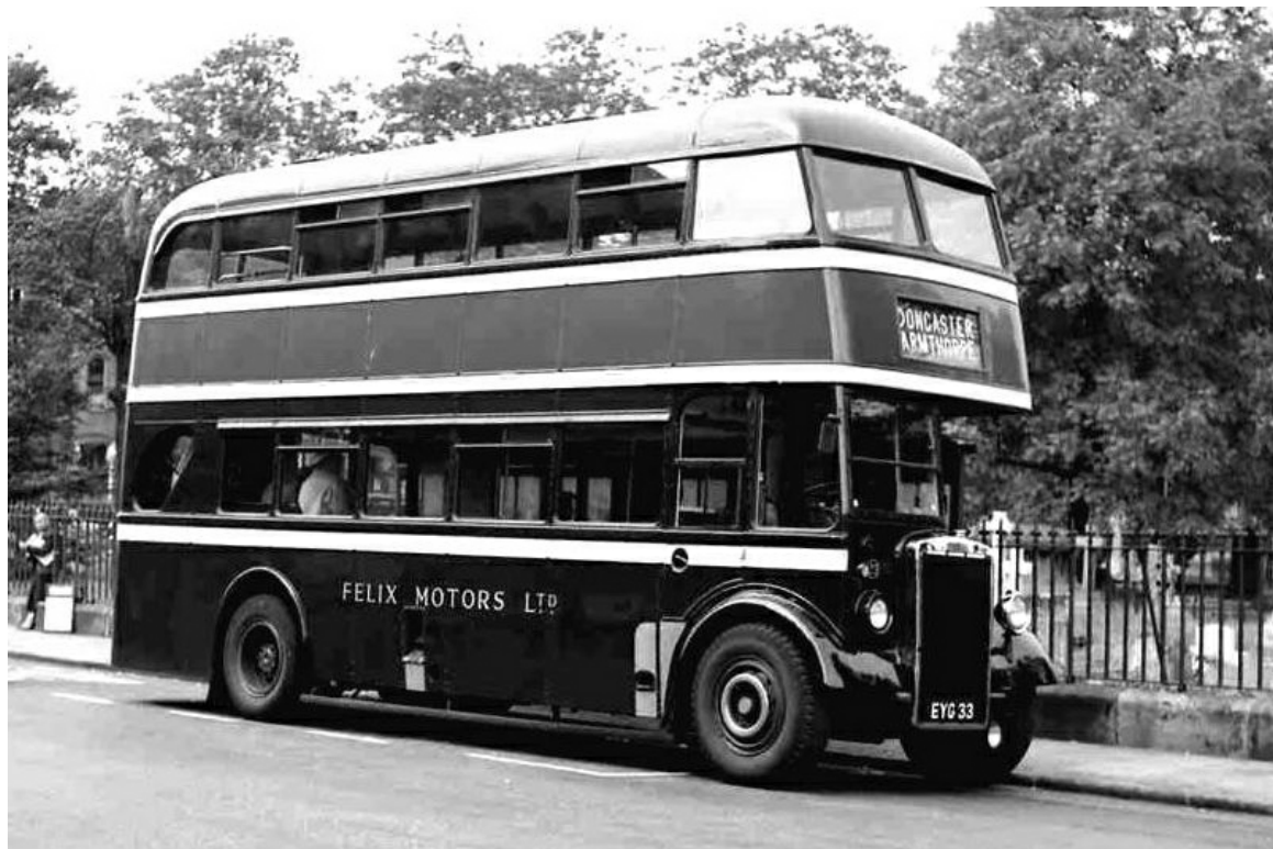
No. 23 (EYG33) was a 1946 Leyland PD1 with Roe H31/25R bodywork seen here in Churchgate, Doncaster in 1957.