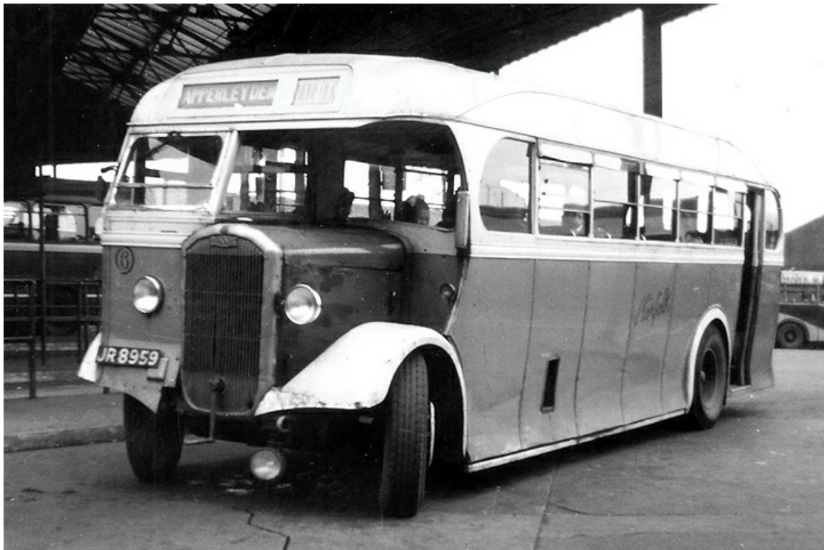
No. 6 (JR8959) was a 1938 Dennis Lancet II with Dennis 35-seat rear entrance bodywork.