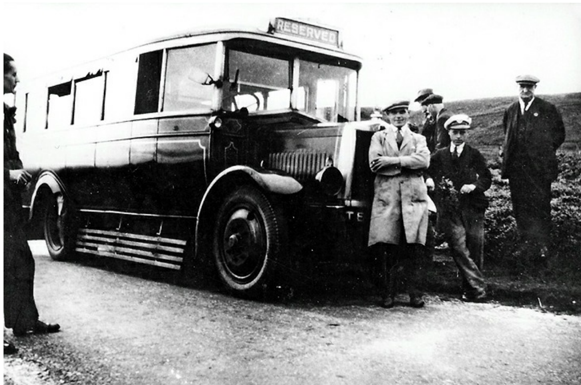
TE919 was a Leyland Leveret LA2 with Leyland bodywork that operated for the Norfolk family before the introduction of their own stage service. It was probably disposed of following the failure of the Allendale venture around 1929. (The Bus Archive).