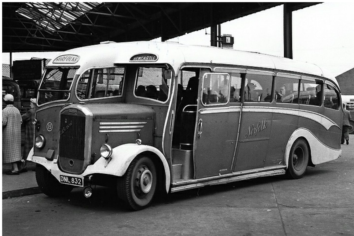
No. 15 (DNL832) was Norfolk's last vehicle purchased in 1949 and was the favoured Dennis Lancet with Duplex 33-seat coachwork. (The Bus Archive).